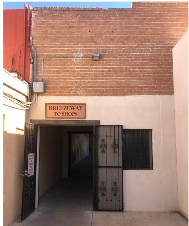
South and north sections of portal