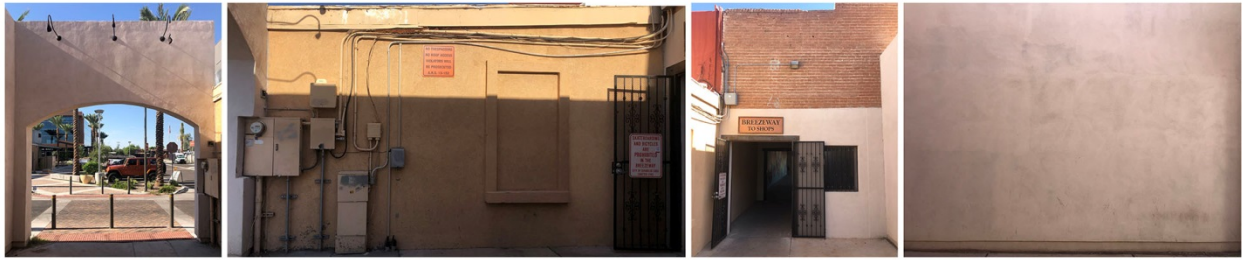
South, west, north, and east sides of the breezeway portal