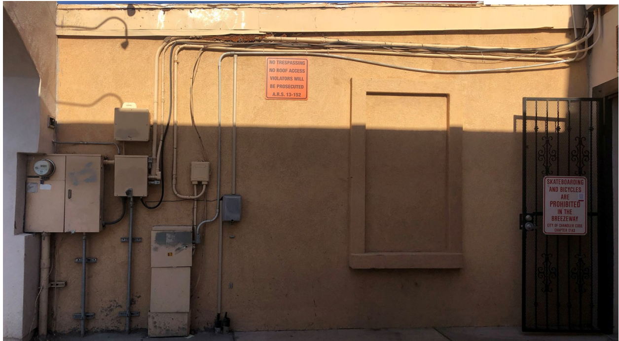
West section of portal