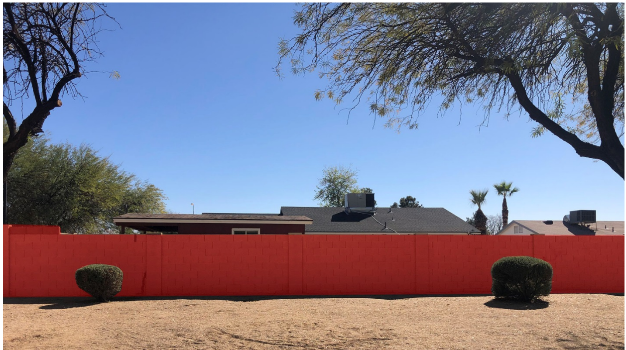
Detail of wall section