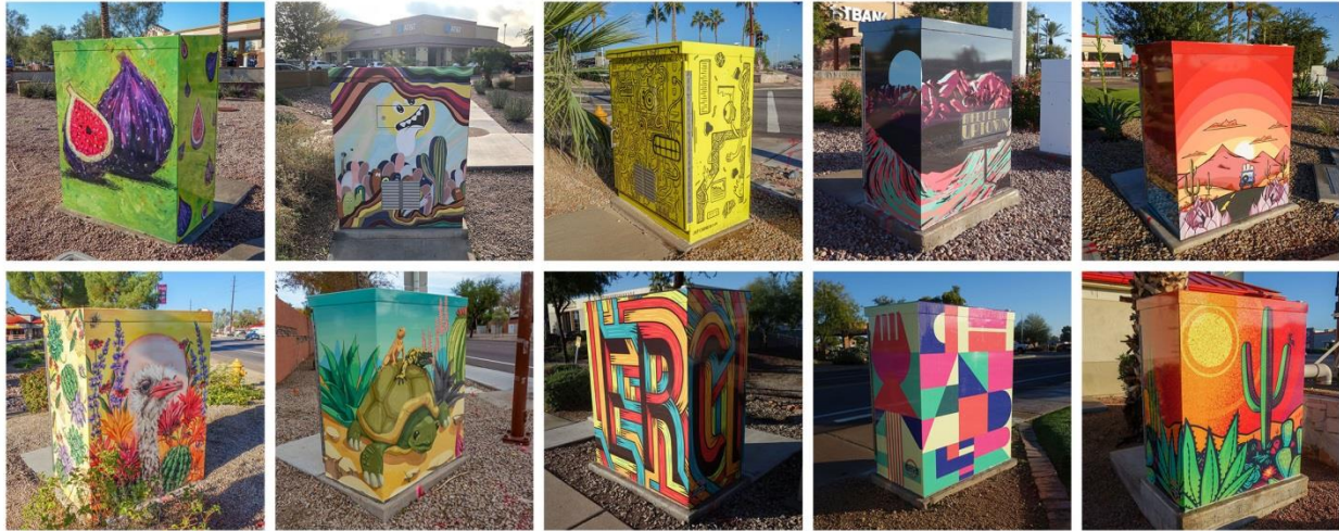
2019 Designs installed along AZ Ave and Alma School Rd